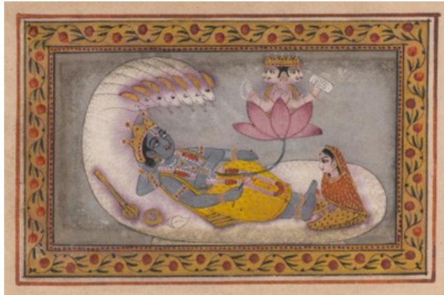
A depiction of Vishnu asleep on the serpent in the cosmic ocean, Asian Art Museum

Early texts depict Viṣṇu on waters or a serpent, but not with all three elements combined. The complete triune image, Viṣṇu, Ananta, and the Ocean of Milk, appears later, in 6th-century Cambodian inscriptions and Tamil Ālvār poetry (6th–9th c. CE), where it becomes a key devotional motif.