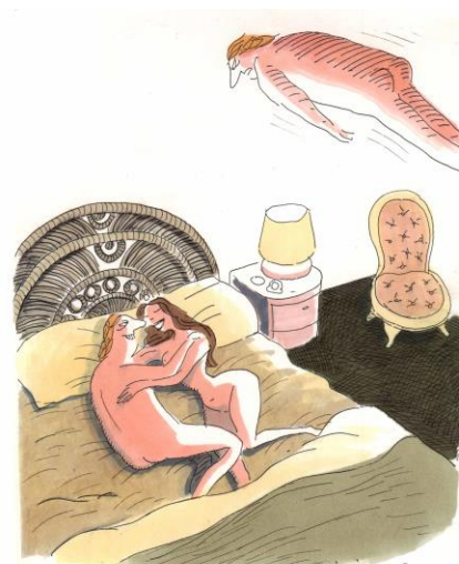
"Damn! Of all the times to have an out of body experience!"

By accepting this syllabus, you are agreeing to participate in frank discussions of many matters that are commonly avoided in public and considered offensive or disturbing by some. These include—but are by no means restricted to—unusual phenomena such as hauntings, alien abductions, as well as ritual practices that are forbidden by some religions, including witchcraft and magic, and accounts of encounters that may be erotic, terrifying, or disturbing. If you are not ready to critically discuss such matters, do not take this course.