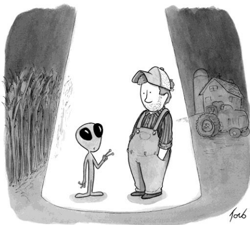
“It’s entirely your choice: a crop circle followed by a probing, or a probing followed by a crop circle.”